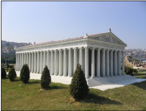
Reconstruction of the Temple of Artemis, based upon remaining ruins

... God ... highly exalted Him and gave Him the name that is above every name so that at the name of Jesus every knee should bend, in heaven and on earth and under the earth, and every tongue should confess that Jesus Christ is Lord, to the Glory of God the Father Philippians 2:9, NRSV