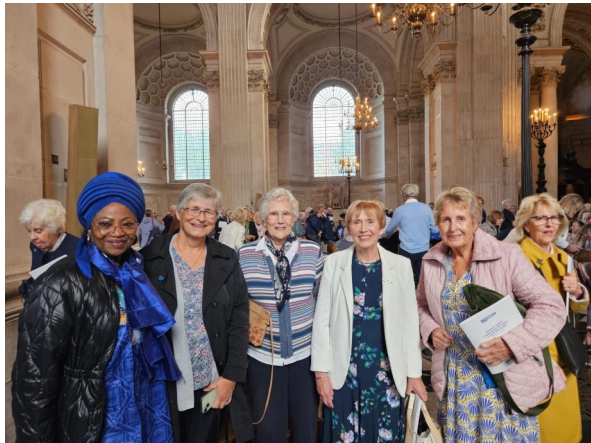
Members of our Mothers' Union at the Anniversary Service in St Paul's Cathedral