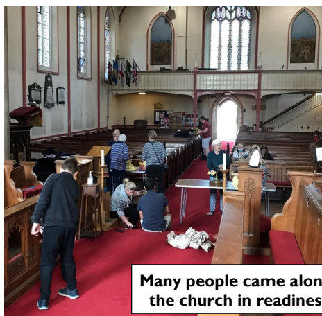
Many people came along on Easter Saturday to clean the church in readiness for our Easter celebrations