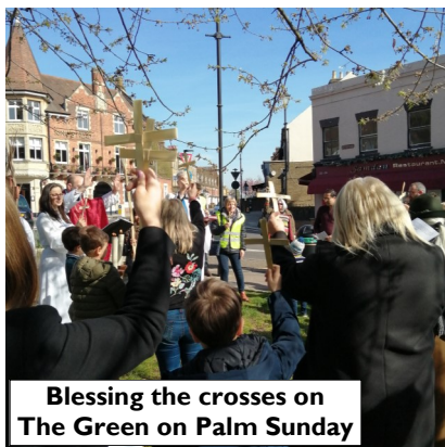
Blessing the crosses on The Green on Palm Sunday