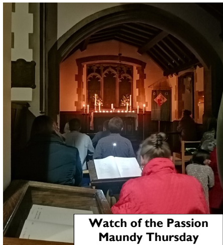
Watch of the Passion Maundy Thursday